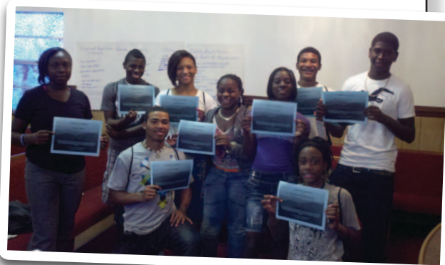
Students proudly display their certificates after participating in the Making Proud Choices workshop.