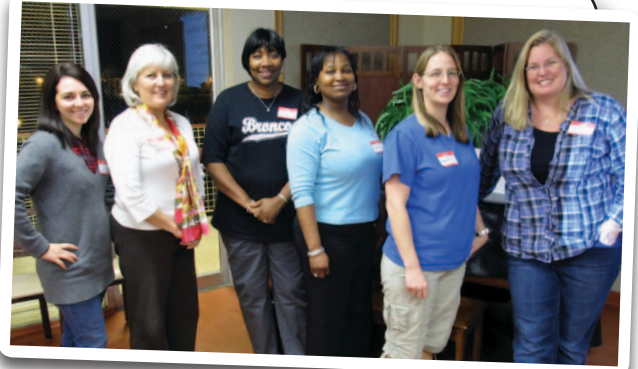
Parents and trainers celebrate the successful launch of the Madison County Leadership Task Force.

Since launching the pilot project, Madison County experienced a 47.5% decrease in STD rates among 15–19-year-old youth in 2011, indicating they now rank 51st out of 67 counties in the state in STD rates among youth. This is a remarkable improvement from the 2008 data, which ranked them at 2nd in the state. The work of the HIV/PEP and collaborative partners in the county contributed to this decrease. Strategies used in the initiative, and evaluation results will be used to create a rural youth STD prevention guidance document that will be widely distributed in Florida and the nation.