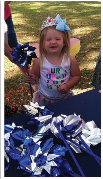
Pinwheels for Prevention organizers sent a clear message: Each child deserves a safe and nurturing environment.